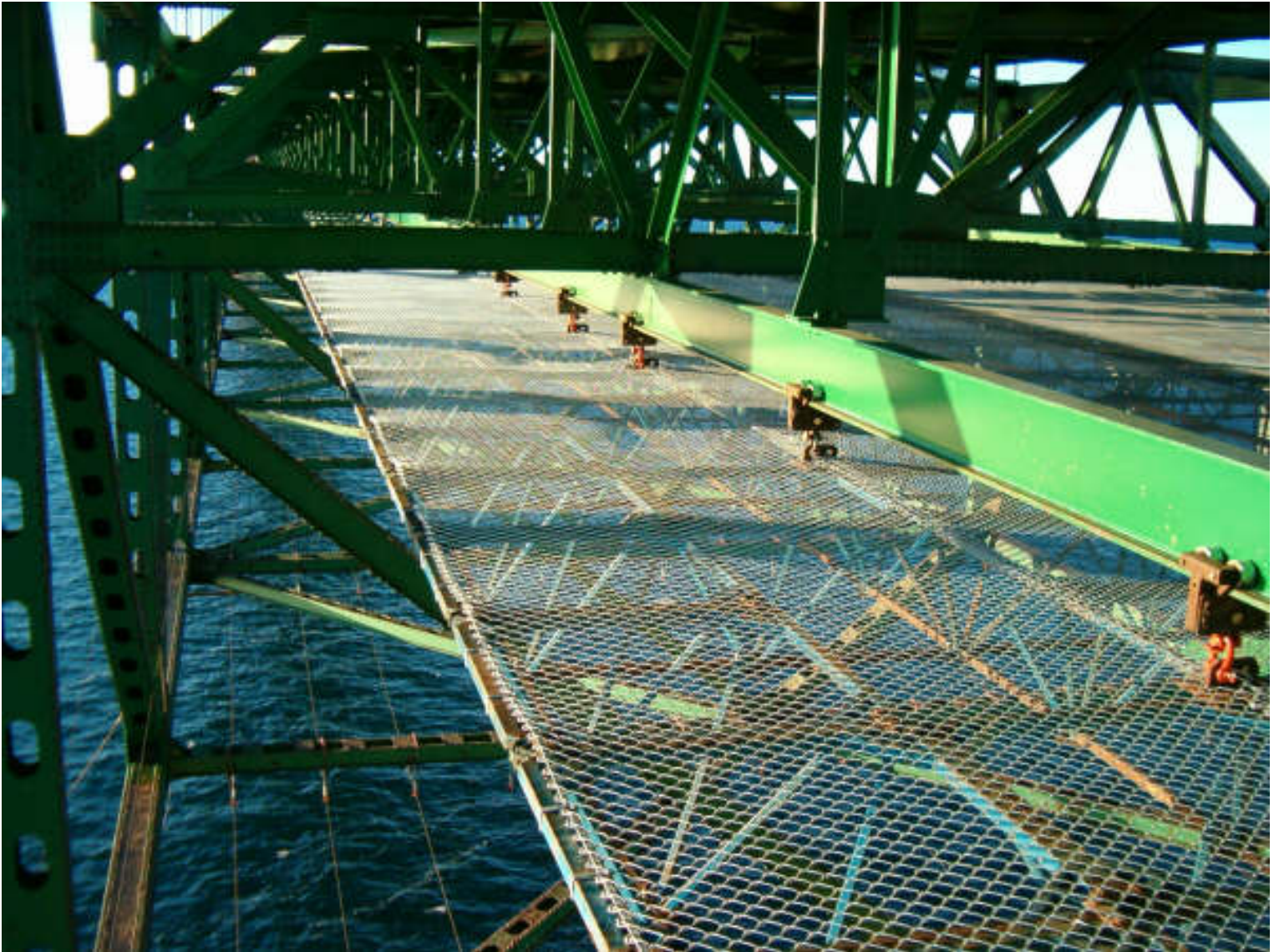
Beeche System Rolling Platform Below Lower Truss Chords Cable Supported/Metal Deck Platform System-Main Cables Shown