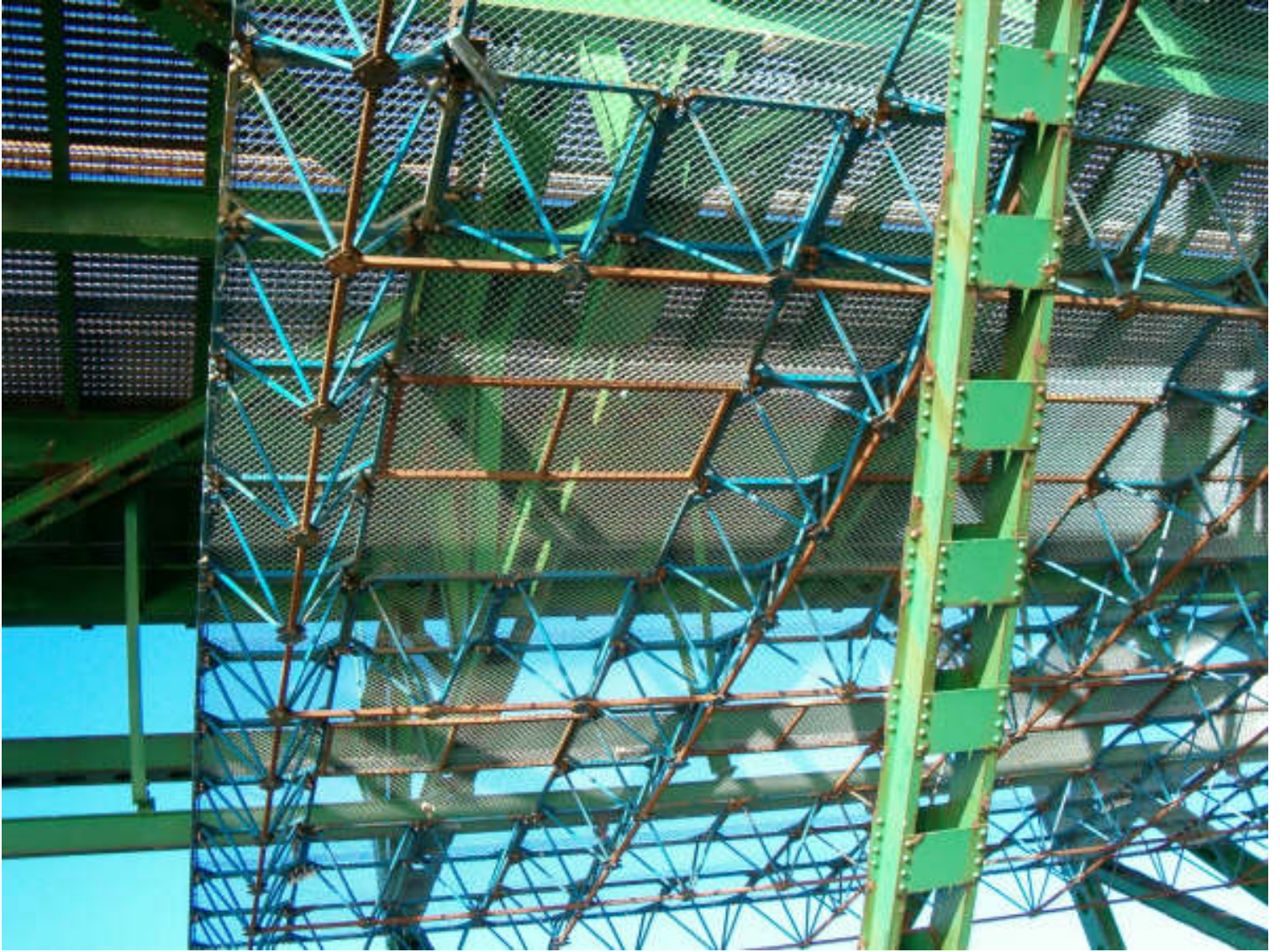
Beeche System Rolling Platform Below Lower Truss Chords