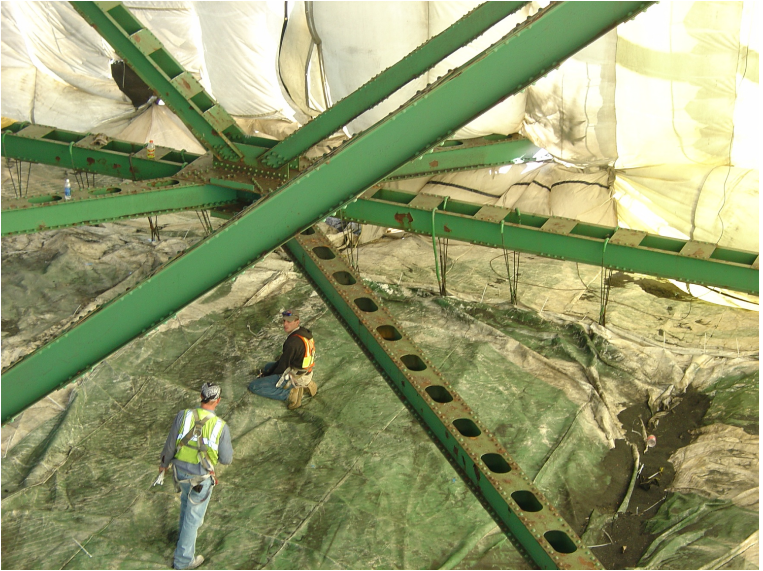
Containment Side & Floor Tarpaulins & Vertical Tie Ups Looking Down