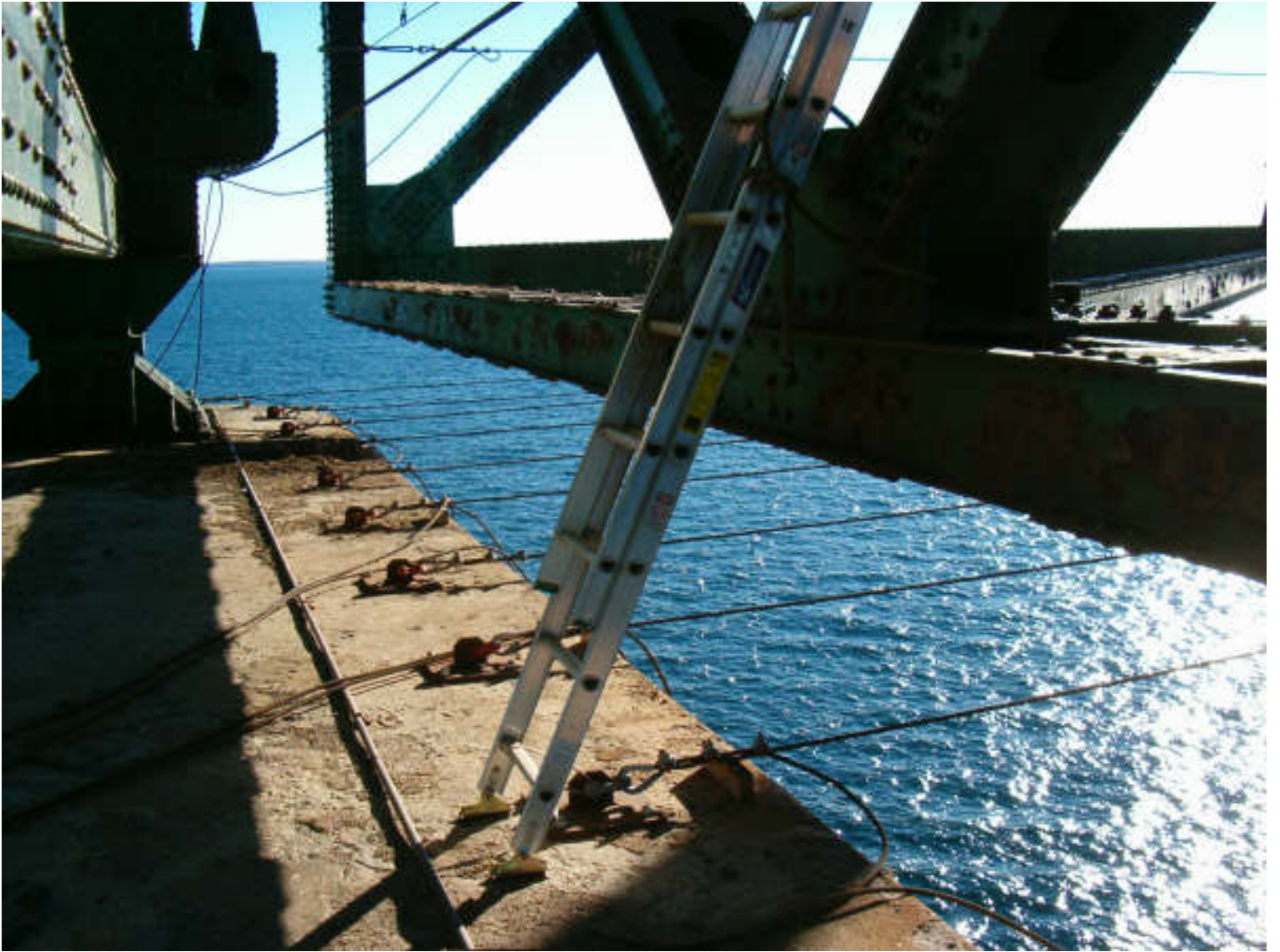
Main Cable Anchor Plate End Support Assemblies