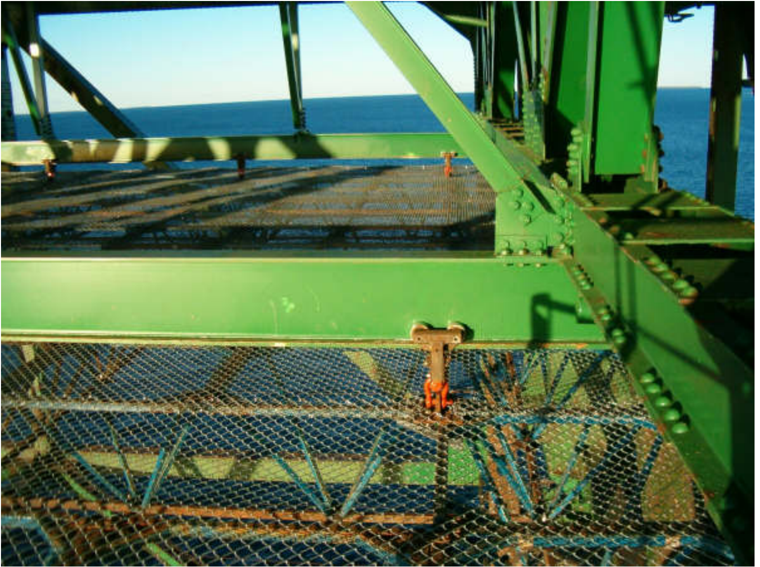
Beeche System Rolling Platform Below Lower Truss Chords