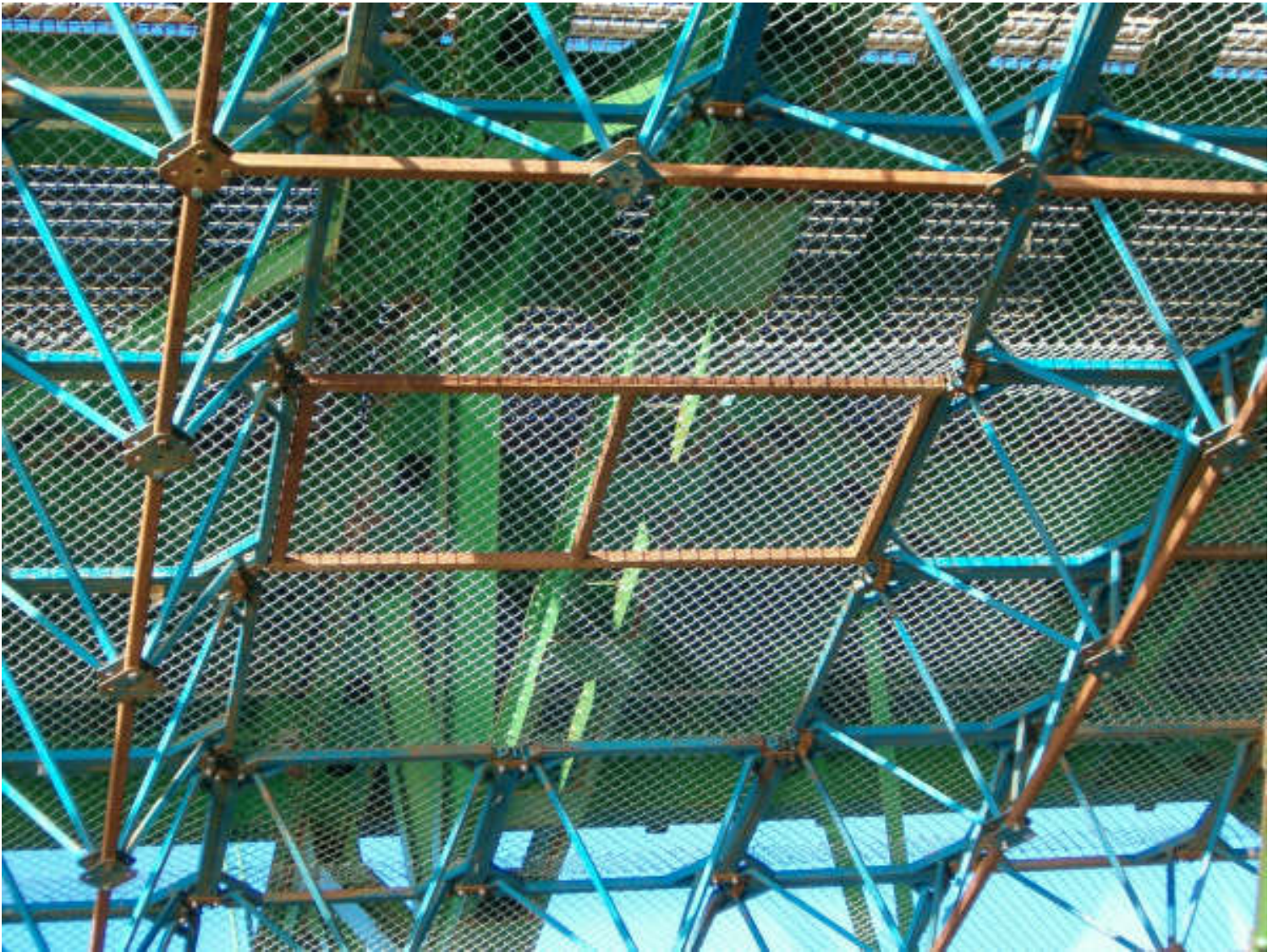
Beeche System Rolling Platform Below Lower Truss Chords