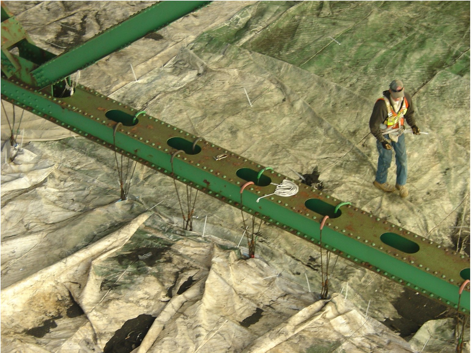
Containment Floor Tarpaulins & Vertical Tie Ups Looking Down